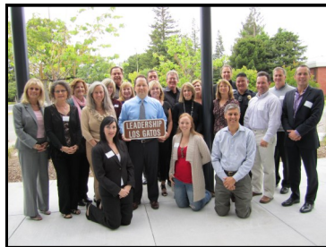
Class of 2010-2011