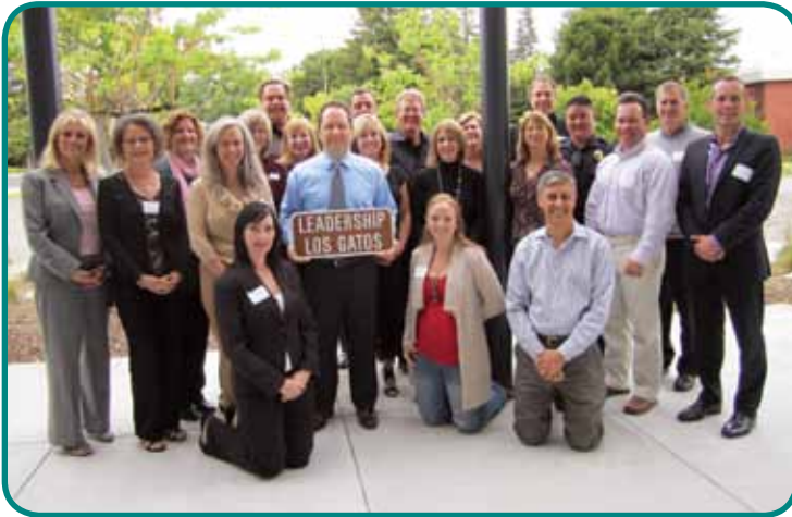
The 10th Anniversary Graduating Class of Leadership Los Gatos

Leadership Los Gatos is a program for people of all backgrounds and interests who wish to become more involved in the community. Its mission is to engage, educate and develop service-oriented individuals who live and/or work in Los Gatos for leadership roles in community and neighborhood organizations, schools, places of worship and Town Government. Applications for the 2011-2012 program are available at the Chamber office and on the Town's and Chamber's website.