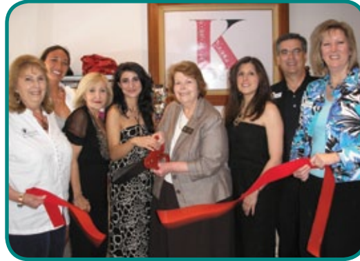
Ribbon Cutting for Kitsch Couture June 18, 2010

Couture , a woman's apparel boutique finally spread its wings in November of 2006, in a historic building in Saratoga. She felt that Saratoga was lacking in retail outlets. The demographics were good, she didn't have a lot of competition and she was filling a niche.